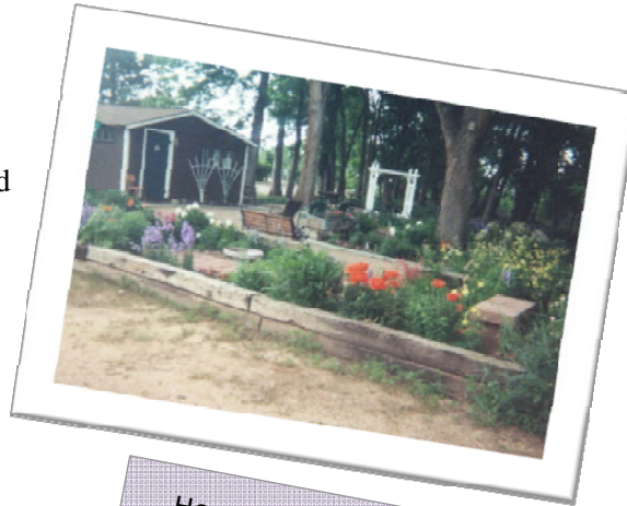
Houston Gardens Fund

8th Street Company Fund A Woman's Place Client Emergency Fund Baca County Community Foundation Florence J. Berry Fund for the Platteville Museum BillWinde Fund Dr. Thomas R. and Janis S. Dunn Fund For Goodness Sake Fund Fort Lupton Area Community Fund Greeley Lions Club Fund Greeley Rotary Fund Greeley Rotary W.D. Farr Endowment Fund Greeley Trails and Open Space Fund