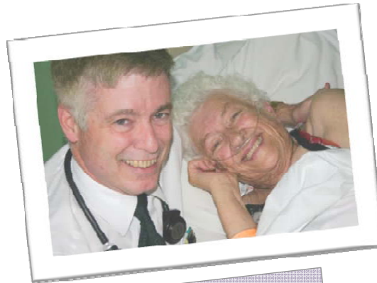
Hospice Endowment Fund