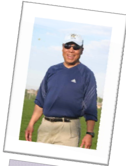
Sam Chuenchit Soccer Scholarship

Aragon Hispanic Student Fund Arts Alive! Scholarship Fund