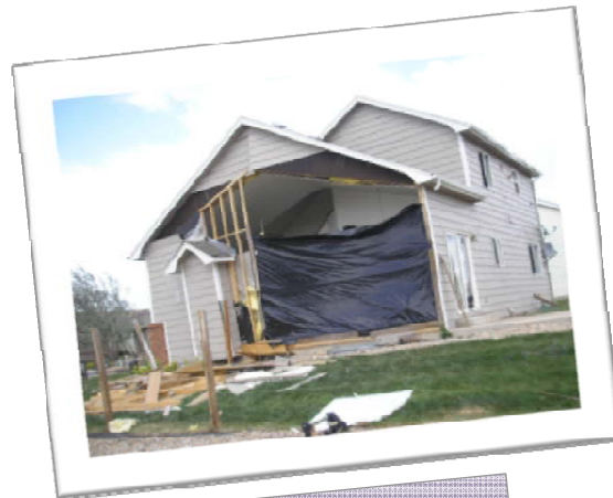
Tribune Crisis Tornado Relief Fund

Sam Chuenchit Soccer Scholarship Deason Scholarship Fund Fort Lupton Community/Floyd Acre Memorial Scholarship Fund Judd K. Fulton Memorial Scholarship Fund Mildred S. Hansen Trust Hispanic Women of Weld County Lynne and Gladys Hopkins Family Scholarship Fund Leoma D. Hunter Trust Alison Jenkins Memorial Scholarship Fund Kristopher G. Mansfield Memorial Scholarship Fund Carl Mason Family Agricultural Scholarship Fund Helen McCandless Trust Nauta Annual Scholarship Fund "Doc" Patterson Scholarship Fund Peschel Memorial Scholarship Fund Dr. John A. and Patricia C. Rosales Memorial Scholarship Fund SasonsFund Scholarship Fund Highland Community/R. Lee and Rebecca Seward Education Fund Weld County Builders Association Scholarship Endowment Fund Weld County Builders Scholarship Fund Winograd Greeley Central High School Scholarship Woolf Scholarship Fund