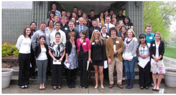
2010 Community Foundation Scholarship Recipients

The Community Foundation's scholarship program is made up of many different scholarship funds established by generous individuals or organizations wanting to assist students in obtaining post-secondary education. The Foundation provides thousands of dollars annually in scholarship assistance to all types of students including graduating high school seniors, undergraduate, graduate and vocational students.