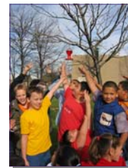
Project BEAR funded by the Littler Youth Fund.