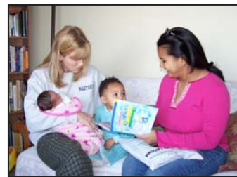
United Way—Bright Beginnings