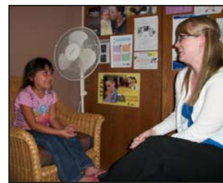
Greeley Transitional House

The Women's Fund of Weld County , a component fund of the Community Foundation, also announced its annual grants totaling $10,000. The following organizations received funding in 2010: