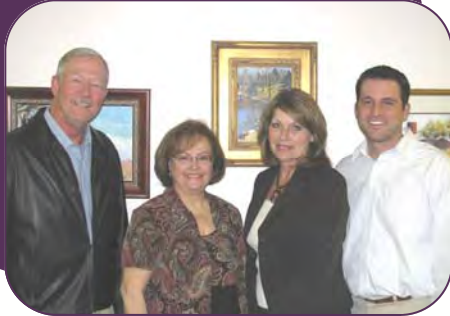
2011 Executive Committee

The Community Foundation is made up of tremendous leaders. They are our volunteers, our contributors, our Board of Directors, our staff. They are those who give of themselves so that we can continue to enhance life in our outstanding region. The volunteers at the Community Foundation are a diverse group of dedicated individuals, each bringing their own skills and expertise to enhance our work. They are part of everything we do. They oversee investment strategies, review scholarship and grant applications, advise on policies and procedures and create relationships. We are humbled by their ongoing and deep commitment, and we thank them for their tireless efforts on our behalf.